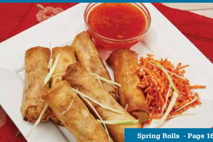
Spring Rolls - Page 16