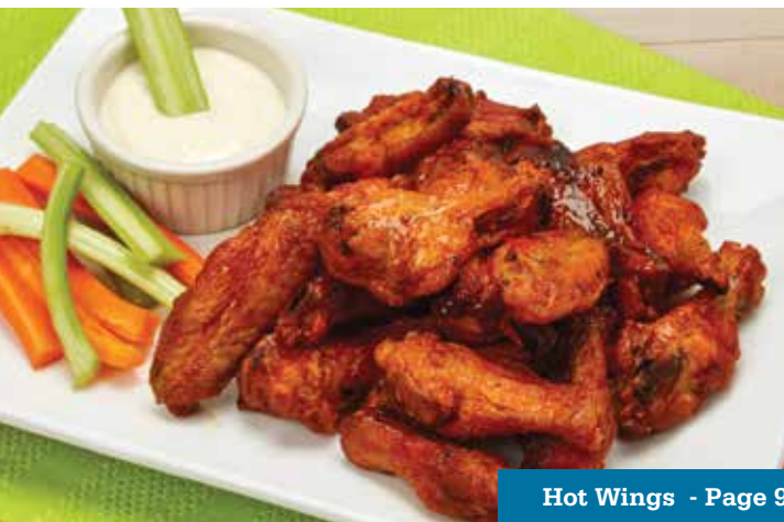
Hot Wings - Page 9