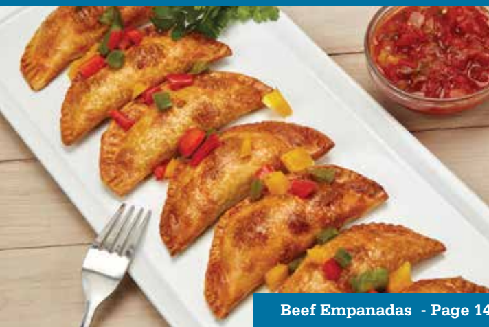
Beef Empanadas - Page 14