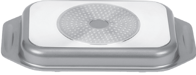
GRILL PAN* (underside)